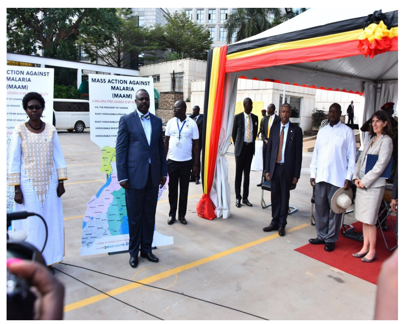
H.E Yoweri K Museveni with Ms Charlie Webster at the launch of UPFM and MAAM

The UPFM formed as a result of a resolution of parliament, and launched by His Excellency the President of the Republic of Uganda on 5th April 2018, is a platform of Members of Parliament from different political shades who collectively generate visibility and provide leadership to the control and eventual elimination of malaria from Uganda. The forum serves as advocates for political, legislative and community action for a malaria free Uganda. The UPFM aims to respond effectively to the scourge of Malaria through advocacy and providing best examples for raising the profile of malaria at both national and international arena. UPFM uses its members to intensify the legislative, budgetary and oversight role to cultivate visibility of malaria issues at policy level. Each Member of Parliament has taken up the mantle of ensuring "a malaria free constituency is my responsibility".