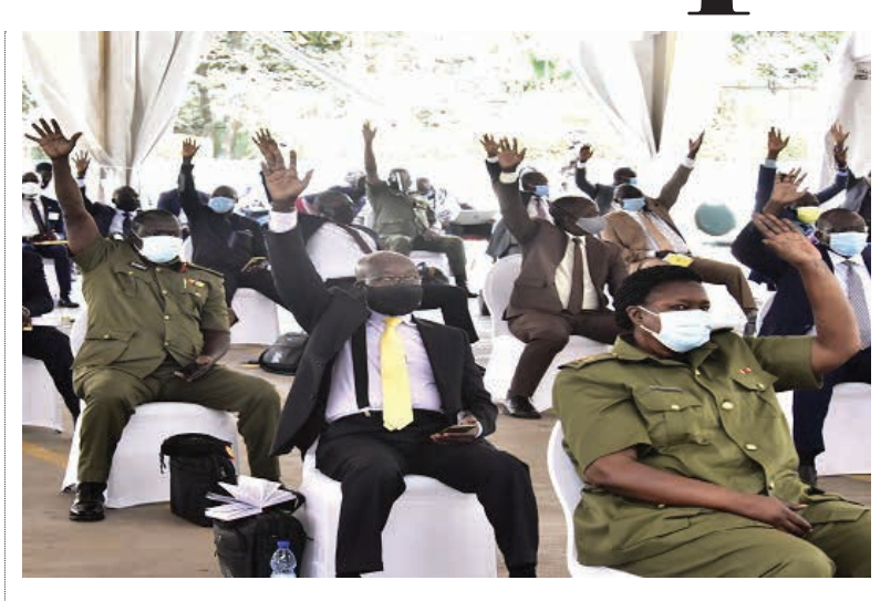
MPs vote to approve the appointment of Ms Robinah Nabbanja as Prime Minister.

With the approval of the Prime Minister and Vice President, the 11th Parliament went on to approve 30 more female ministers, making it the highest representation of women in the Cabinet since independence.