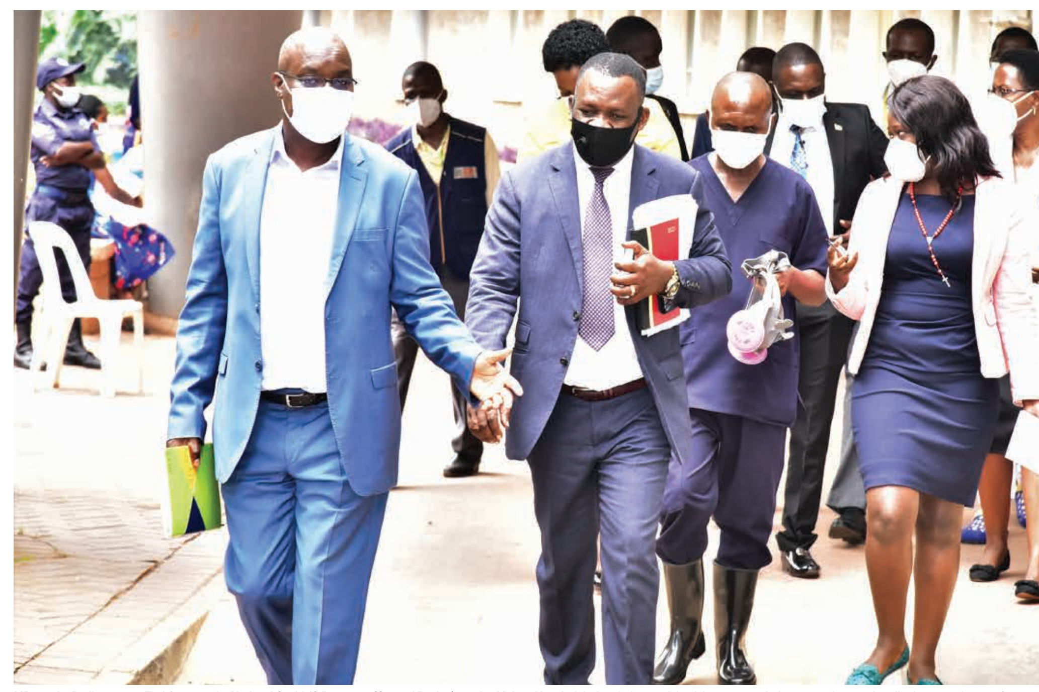
MPs on the Parliamentary Taskforce on the National Covid-19 Response (Central Region) touring Mulago Hospital during their oversight visit to access their preparedness to handle the second wave of the Covid-19 pandemic in the country.