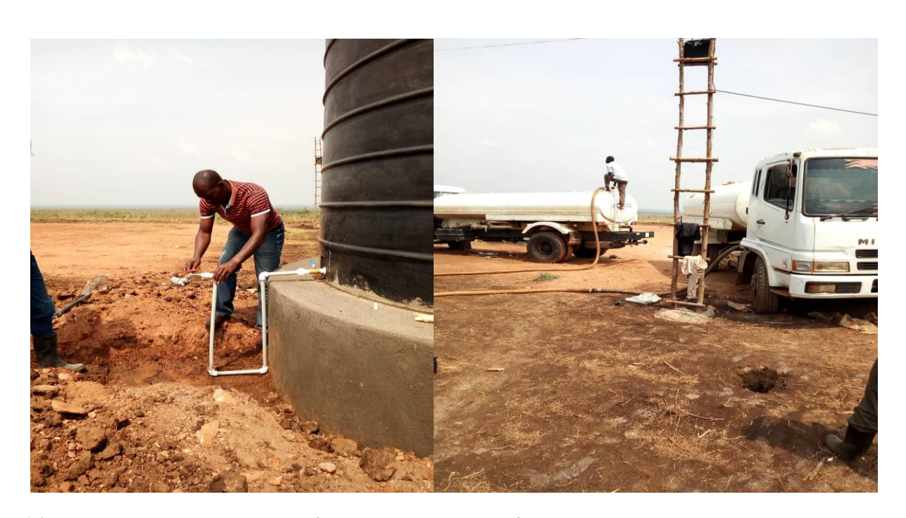
Fig 10. Water tank and delivery truck on site