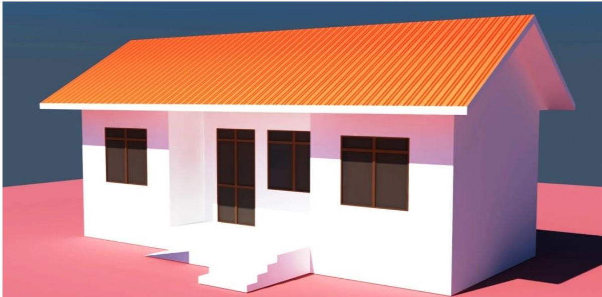
Fig12. Some of the housing designs for the 900 houses to be built in Bunabutye Landslides survivors resettlement scheme Page 14 of 14