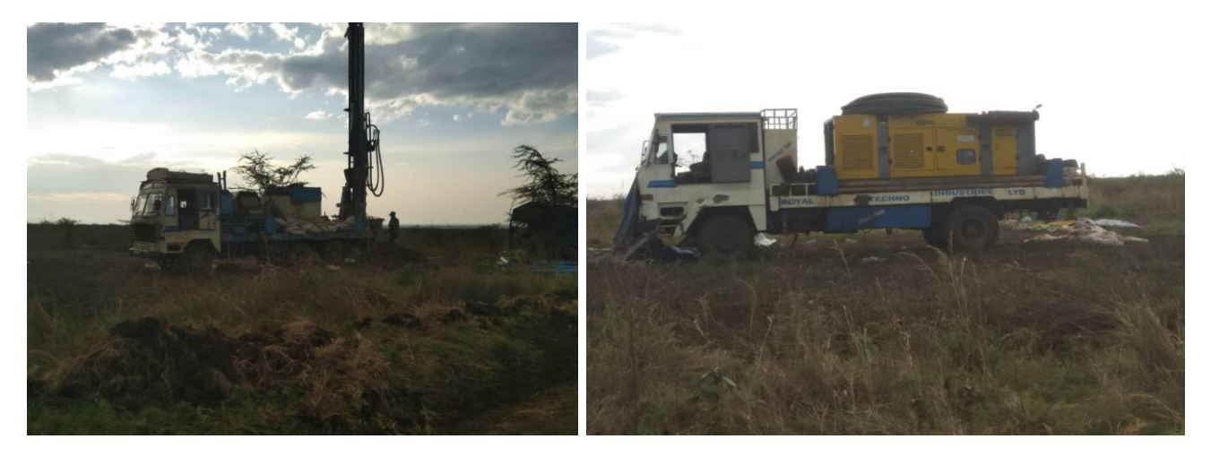
Fig 9. Drilling of powered water-production wells and boreholes on-going