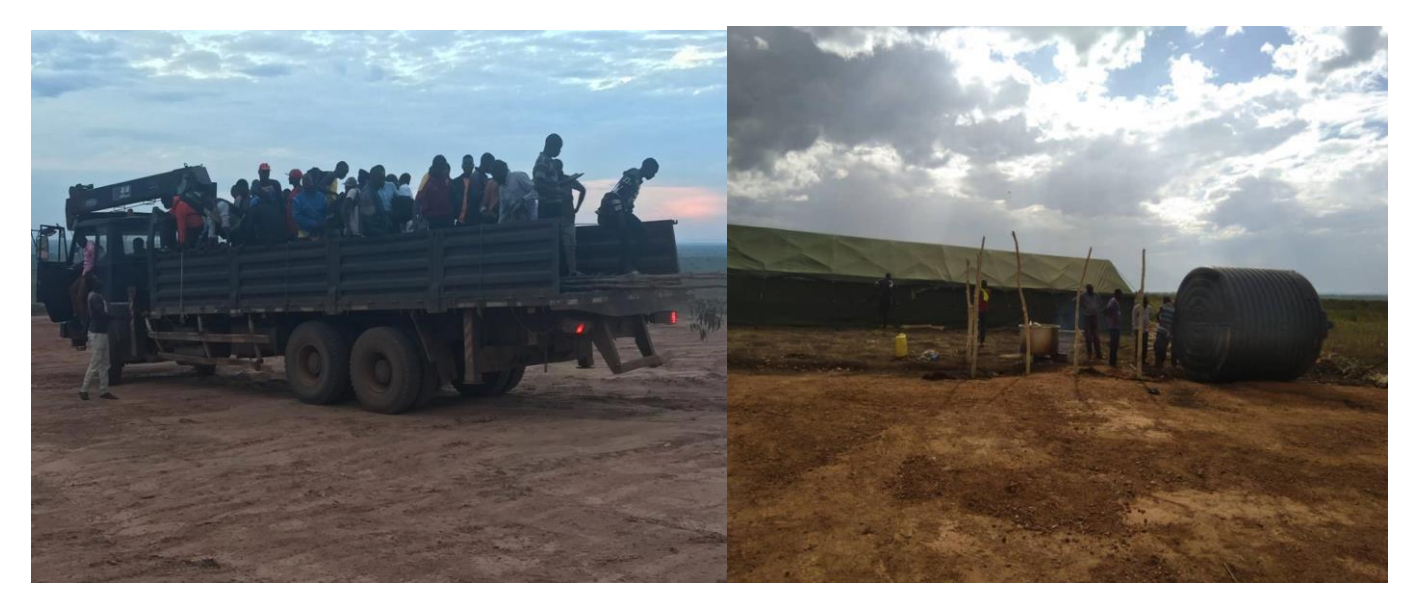
Fig 2. A Contingent of Uganda Police Construction Unit Officers arrive and settle on site.