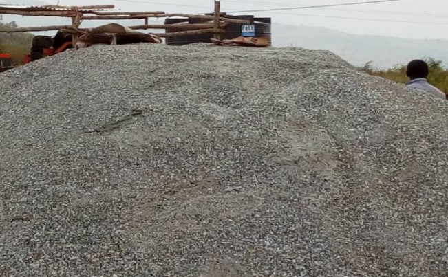
Fig 6. Truck delivering materials on site.