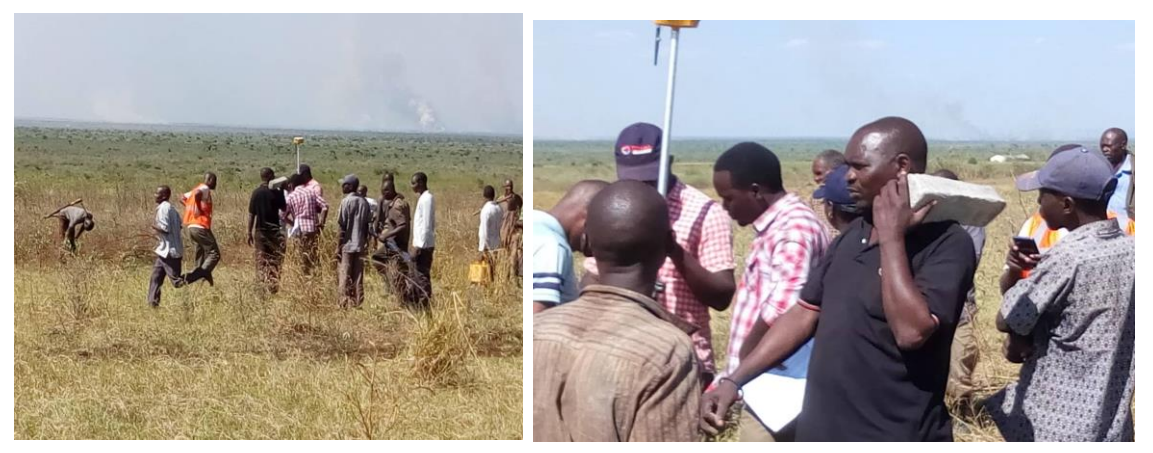
Fig.11 Surveyors opening the first 270 plots of one acre each for contstruction of homes