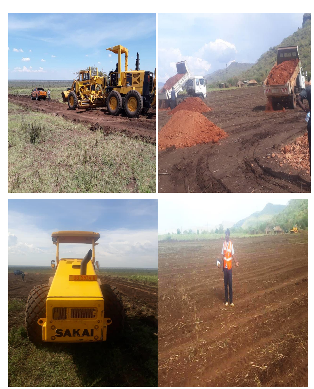
Fig. 1 Grading of base camp