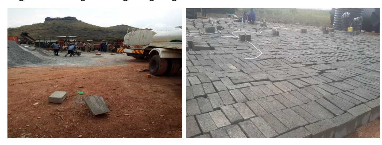
Fig 8. Blocks laid-out to set